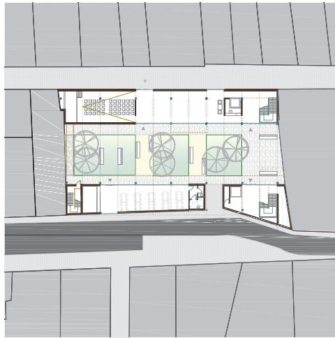
V. Miguel Redón Redón 19-20

In our projects' practical approach , we will refer to dwelling as the main subject. Accommodation is undoubtedly the first human necessity addressed by architecture. The primitive hut is in its origin, giving shelter to man: "Protecting the fire, the centre of social relation", as Gottfried Semper described, in the middle 19th century, the main task of the home.