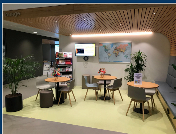
International Lounge ICT